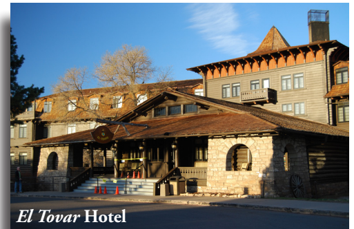
El Tovar Hotel

expensively constructed and appointed log house in America," the Santa Fe Railroad commissioned its construction in 1902. The El Tovar cost $250,000 to construct and was considered by many to be the most elegant hotel west of the Mississippi River. (Breakfast, Dinner)