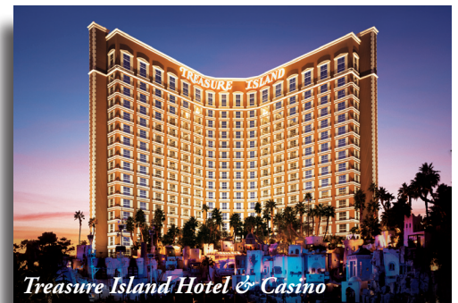
Treasure Island Hotel & Casino

Following an included breakfast at the Canyon rim, we depart for Las Vegas making several stops along the way. First, we'll make a stop at the National Geographic Visitor Center for an included viewing of the Grand Canyon IMAX film . Your senses are almost overwhelmed by sight and sound as the Canyon comes alive through IMAX technology on a six-story screen. Continuing on, this afternoon we come face-to-face with the mighty Hoover Dam as we travel over the Hoover Dam bypass bridge on our way to Las Vegas. Las Vegas welcomes you this evening and invites you to discover its many resort hotels and gaming options. Our accommodations at the Treasure Island Hotel & Casino makes it easy for you to access the many nearby hotels including the Wynn Las Vegas , Encore , Venetian , Pallazzo , the Bellagio , Caesars Palace and Mirage . (Breakfast)