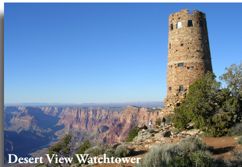
Desert View Watchtower

may see prairie dogs and slow-moving cows, deer, and antelope grazing the wooded flatlands and Southwestern Arizona desert. The opulence of oversized reclining seats along with extra-large windows make for a true first-class experience, as do the fresh fruit, pastries, coffee and juice that will be served along the way. Upon arriving at Grand Canyon's authentic 1910 depot, you'll find yourself gazing at the most awesome landscape that no postcard could do justice to. Eons of time are represented in the many colors of earth uncovered by millions of years of erosion by the Colorado River. At 277 miles long, 18 miles wide and one mile deep, it's easy to see why the Grand Canyon is one of the seven wonders of the natural world. Time at your leisure this afternoon to explore the Grand Canyon Village , walk along the rim or visit the Visitors Center . Begin a two night stay at the Maswick Lodge , a modern facility spread over several acres of ponderosa pine forest, located just 1/4 mile from the canyon's edge. (Breakfast)