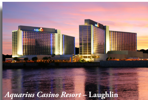
Aquarius Casino Resort – Laughlin

All aboard this morning as we set off on our journey to the Grand Canyon from our departure points. Later this afternoon after a stop for lunch at leisure we'll arrive in Laughlin and its picturesque river setting. As the saying goes, Laughlin was founded on fun! Check into the Aquarius Casino Resort . The largest hotel in Laughlin, it is located along Laughlin's Riverwalk and features a 60,000 square foot casino and nightly entertainment. Relax at the resort's swimming pool or try your hand at lady luck. Enjoy the hotel's lavish buffet this evening at your leisure with an included dinner buffet voucher. (Dinner)