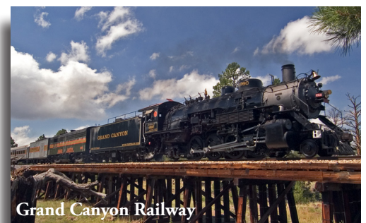
Grand Canyon Railway