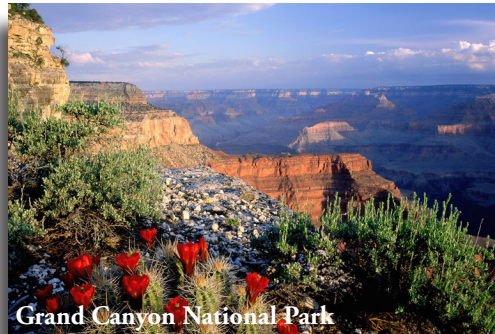
Grand Canyon National Park

Hotel , delightfully styled in 1900s Southwestern décor. Designed to resemble the century-old train depot that housed the original Fray Marcos Hotel which was opened by the Santa Fe Railroad as a Harvey House, our overnight accommodations provide a relaxing western retreat before heading for Grand Canyon National Park . This afternoon you may choose to make the short walk to downtown Williams – a town steeped in nostalgia and known for its quaint feeling of the quiet Old West. Route 66, the main street in town, inspires memories of its own; but 19th-century historic storefronts and well-preserved buildings will take you much farther back – to a time of mountain men, traders, Native Americans, cattle ranchers, and railroad laborers. The remainder of the evening is yours to relax at the hotel and enjoy an included dinner buffet. (Breakfast, Dinner)